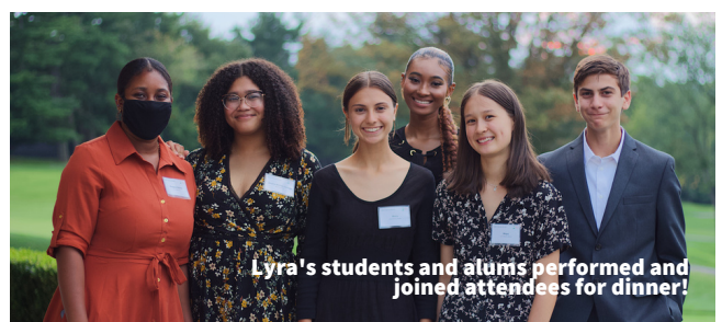
Lyra's students and alums performed and joined attendees for dinner!